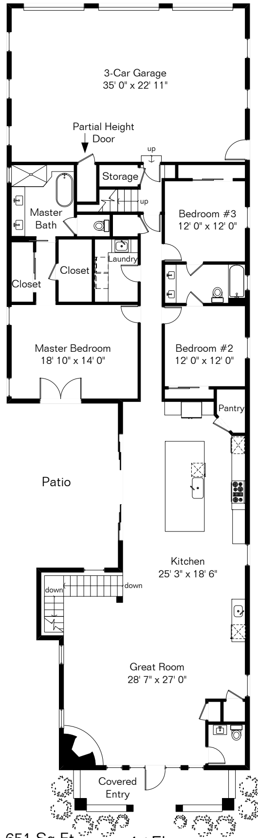
1 st Floor